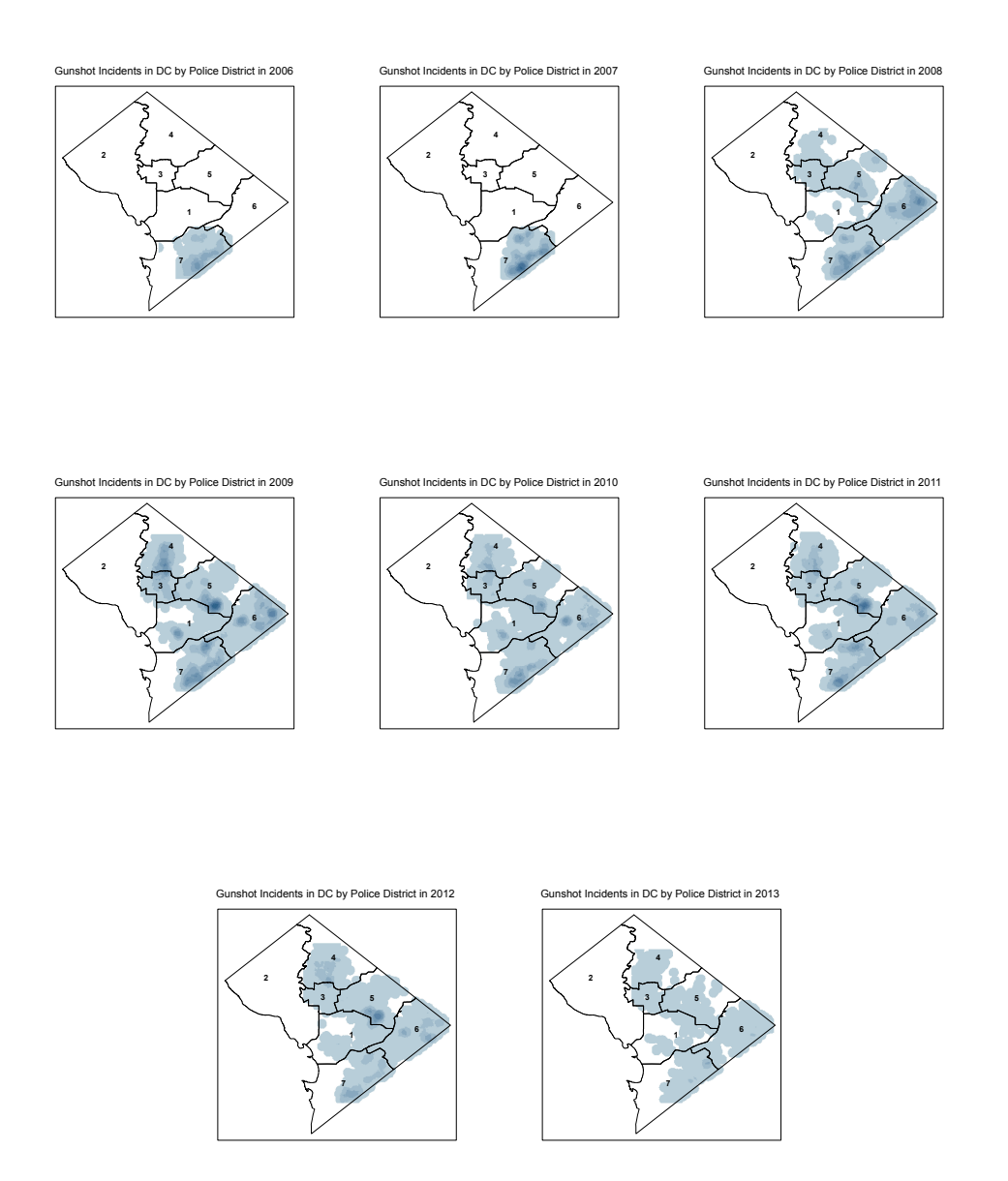
Notes: Shaded regions show the location of detected gunfire in Washington, DC, in each year (January 2006 through June 2013), along with labeled outlines of the seven Police Districts. Darker regions signify more gunfire. Note that ShotSpotter sensors cover primarily Districts, 3, 5, 6, and 7; we restrict our analyses to these regions.